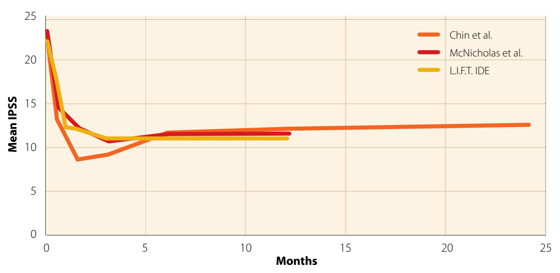
Chin et al.: Urology 2012; McNicholas et al.: European Urology 2013; Roehrborn et al.: Journal of Urology 2013

206-patient L.I.F.T. IDE Study, a multi-center, randomized, blinded study. All primary and secondary endpoints were met. Patients experienced rapid symptomatic improvement, increased urinary flow rates, preserved sexual function and a significant improvement in Quality of Life.